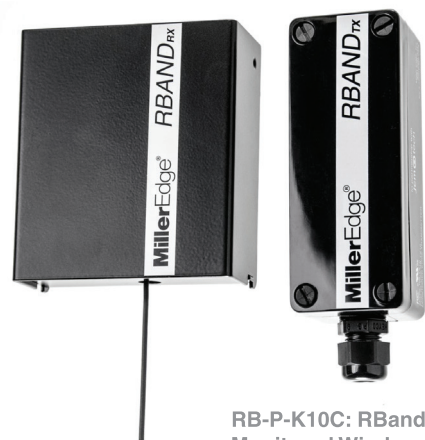
RB-P-K10C: RBand Monitored Wireless Door Edge System

We're happy to announce that we have expanded our RBand product line to meet your needs, eliminating the hassle of wires and saving you time during the installation process. If you haven't heard about the latest addition to our monitored wireless edge system offerings, allow us to introduce you to RBand for Doors.