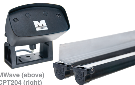
MWave (above) CPT204 (right)

During the week of April 5th-8th, the Las Vegas Convention Center buzzed with excitement as door dealers and industry leaders reunited after a long two-year hiatus at the 2022 IDAExpo. Having the ability to be in-person and share what companies have been up to since the last IDAExpo in 2020 made this year's expo a significant one.